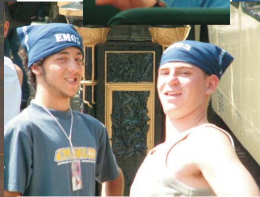
Would you kiss these?